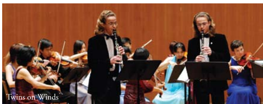
Twins on Winds