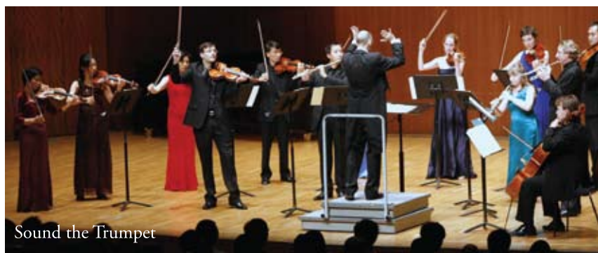
Sound the Trumpet