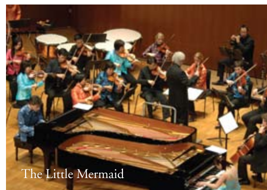
The Little Mermaid