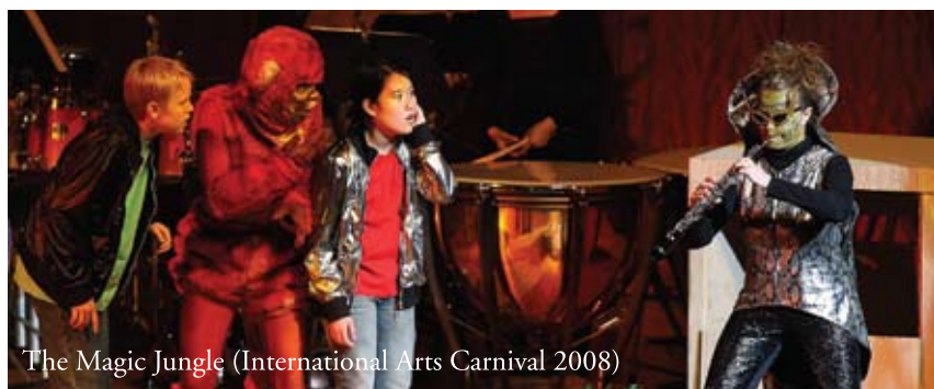
The Magic Jungle (International Arts Carnival 2008)