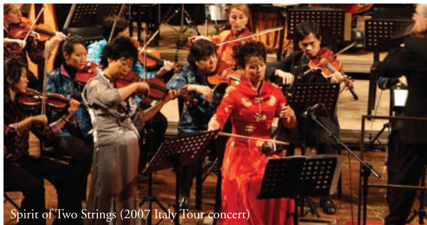
Spirit of Two Strings (2007 Italy Tour concert)