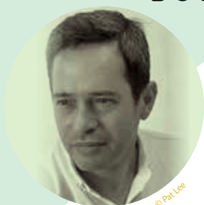
EDUARDO ZUBER guest conductor 艾華度·祖巴 客席指揮

HONG KONG CITY HALL CONCERT HALL 香港大會堂音樂廳